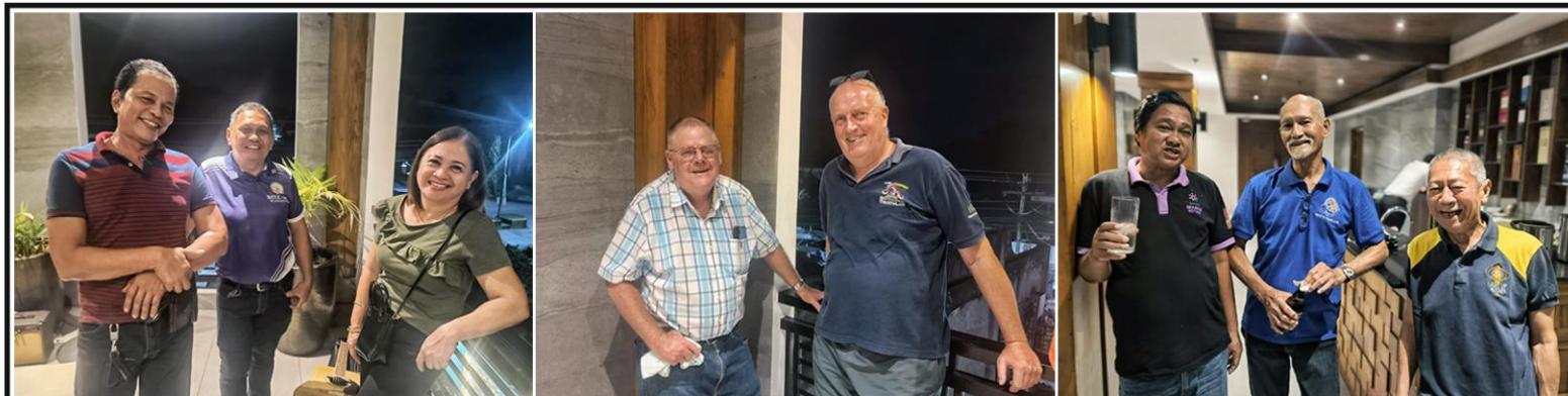
09292023 - RCDN 12th Regular Meeting and Fellowship at Royal Suites Inn.